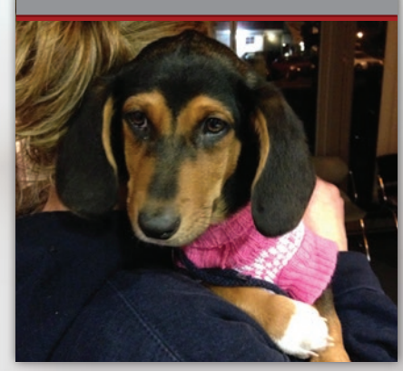
Secondhand Hounds rescued dog, now living at a "forever" home.